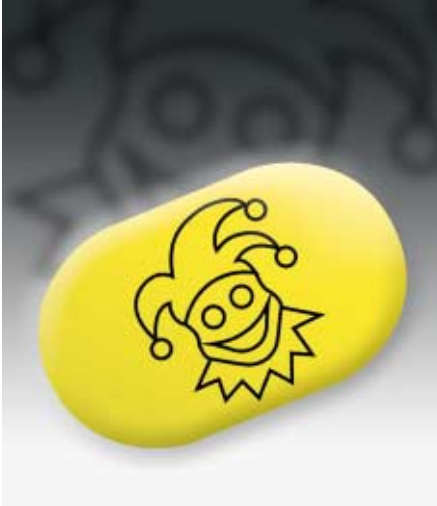
Joker key for direct access to your most essential function

You expect ease of operation and direct access to key functions. And you also want functional variety coupled with first-rate depth of analysis. The EWK 2000 operator control concept gives you all that and more. With a mere four highlighted keys, you can "drive" the entire monitoring process from start to finish, i.e., to your final interpretation. And you can use the joker key to activate the most essential of your own particular process-specific operations, e.g., a filler-spout analysis.