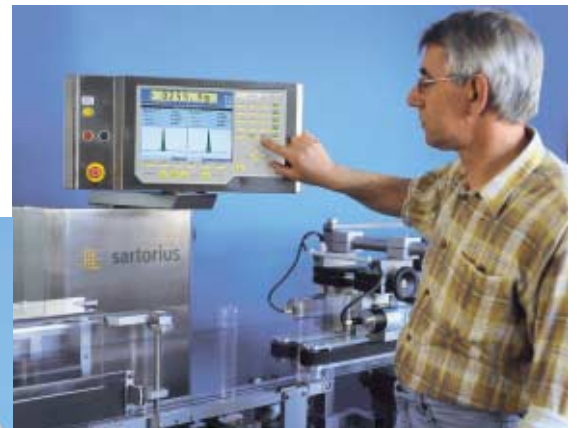
Ease of operation and great functionality thanks to a clear-cut, hierarchical, Windows Standard- supported menu structure.